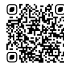
ZOBOLO MAIN PARKING

From Athens, the route is as follows: Korinthos > Tripoli > Sparti > Molai > Neapoli. When you arrive at the beach of Neapoli, follow the signs to Agios Nikolaos (8km further). After 8km, you will come to the village of Agios Nikolaos and a fork in the road. Turn right and continue following the signs to Profitis Ilias. After 5.3km, turn off left onto a dirt road following the sign to Agia Marina, Fossil Forest, Kavο Maleas Monastery, Climbing Park. A freshly paved road starts here. After 1.8km, turn left towards an obvious clearing. Park there. In total, the crag/parking area is 6.2km from Agios Nikolaos.